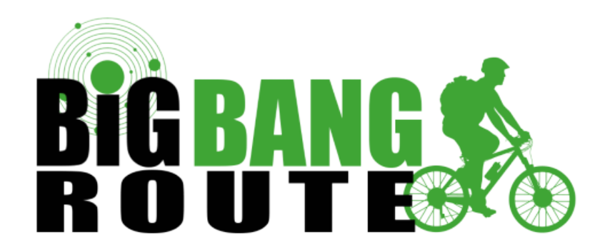
Episode 5: There comes the Solar System